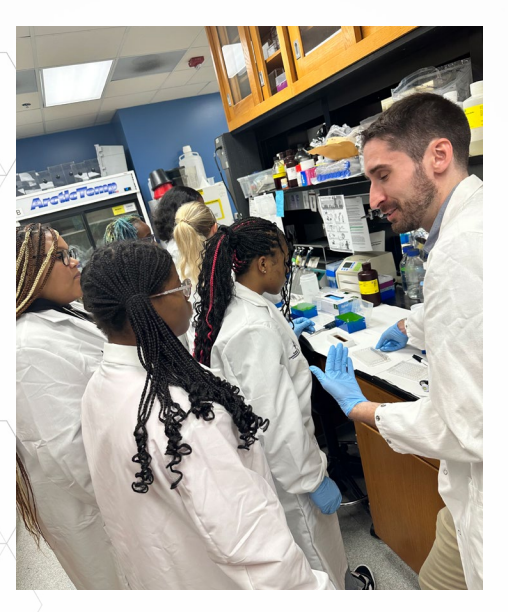
King College Prep Students Attend Youth Lab Exploration Day on Chicago Campus