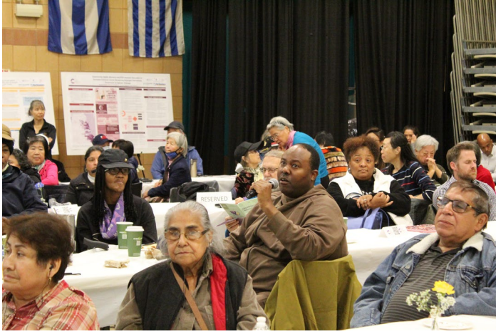
Participants at the ChicagoCHEC 9th Annual Community Forum

Lurie Cancer Center has a long-standing history of commitment to advocacy, education, outreach and engagement. Our community partnerships and programs aim to identify and address barriers to cancer health equity and improve outcomes in traditionally underserved neighborhoods. Working together with new and existing organizations in our communities, our efforts include: